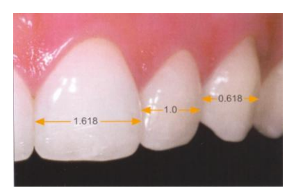
Figure 9: Golden proportion.

Western civilization has drawn the conclusion that for objects to be proportional to one another the ratio of 1:1.618 is esthetically pleasing, known as the golden proportion (Fig. 9). Much has been hypothesized from this ratio, from the mathematical relationship of the chambers of the nautilus shell to facial proportions. As a general rule, if the apparent size of each tooth, as observed from the frontal view, is 60% of the size of the tooth anterior to it, the relationship is considered to be esthetically pleasing. That is, if the apparent width of the central incisor is 1.618, the lateral incisor and canine should be 1.0 and .618 respectively [27].